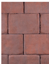
Autumn Blend 16