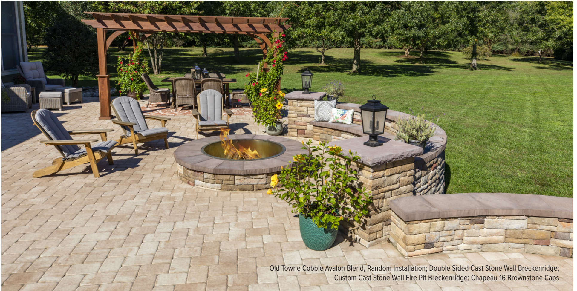
Old Towne Cobble Avalon Blend, Random Installation; Double Sided Cast Stone Wall Breckenridge; Custom Cast Stone Wall Fire Pit Breckenridge; Chapeau 16 Brownstone Caps