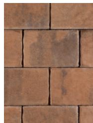
Harvest Blend 16